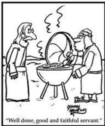
from JoyfulNoiseletter.com