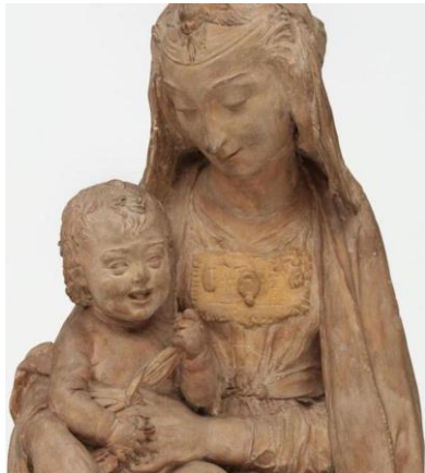
Laughing Jesus on his mother Mary's knee