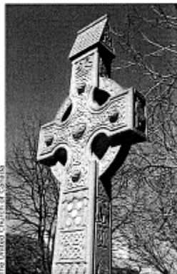
The United Church of Canada