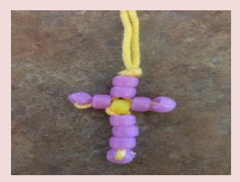
Step 7 : Either using clip knots or just tying the yarn, make the necklace part.