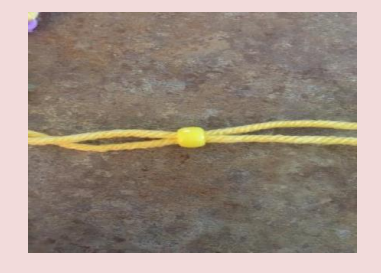
Step 3 : Take one bead (it can be the one of different colour if you're doing that) and put one of the strings through in one direction, and the other string in the other direction. This creates the centre of the cross.