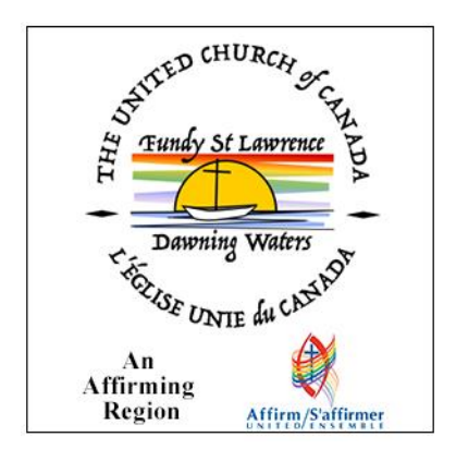
Fundy St. Lawrence Dawning Waters Regional News